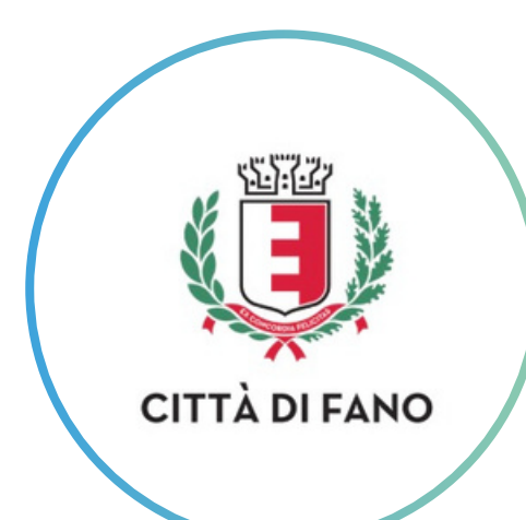
Municipality of Fano